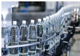
Marking & Coding